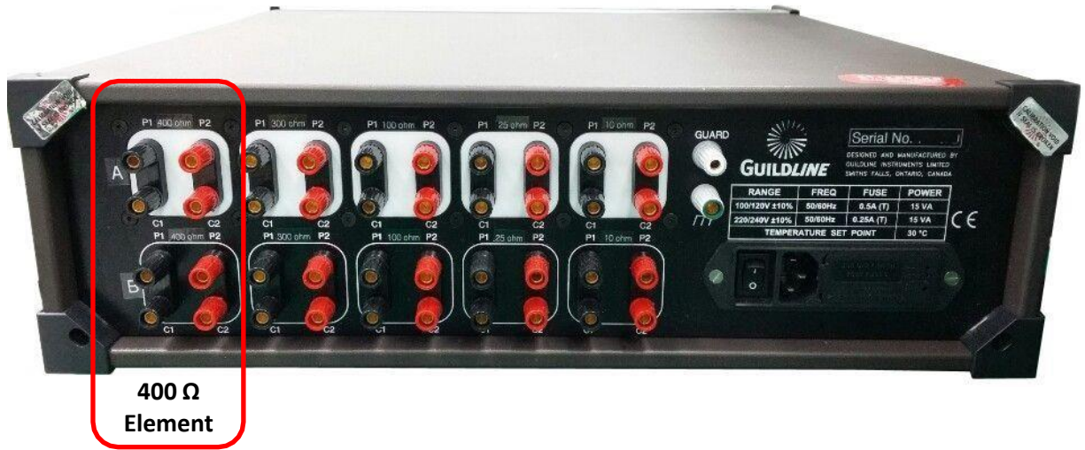
Model 7334-TC with 10 Custom Elements in a Temperature Controlled (TC) Enclosure

Special values such as 25 Ω, 300 Ω, 400 Ω and 2.9064 kΩ and others are available. Guildline also has an option to put the 7334 elements in an enclosed "Temperature Chamber (TC)" 6634A Style Case. The following 7334TC was built for Temperature Measurement and Source applications such as the calibration of Fluke Super Thermometers and for use with Wika/ASL AC Temperature Bridges. The 10 element sets in this unit are (2 x10 Ω), (2 x 25 Ω), (2 x100 Ω), (2 x300 Ω), and (2 x 400 Ω).