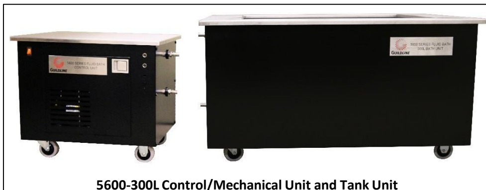
5600-300L Control/Mechanical Unit and Tank Unit

For the larger 300L size there are two separate units, each on wheels. The circulation pump, cooling unit, and electronic hardware are the same, but are placed in a physically separate Control/Mechanical cabinet. This separate cabinet is connected to the separate large 300L bath by insulated flexible hoses that can be of customer chosen length. This unique design allows the 5600-300 Litre bath to fit through a standard door and into a standard elevator and provides flexibility in how the bath is placed in a laboratory. For example the bath tank and the mechanical unit can be placed side-by-side, at right angles, or even with the mechanical unit behind the bath tank.