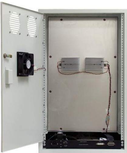
5030 Series Rear Access

These Air Baths have also been designed for ease of field maintenance through the use of modular components and sub-assemblies.