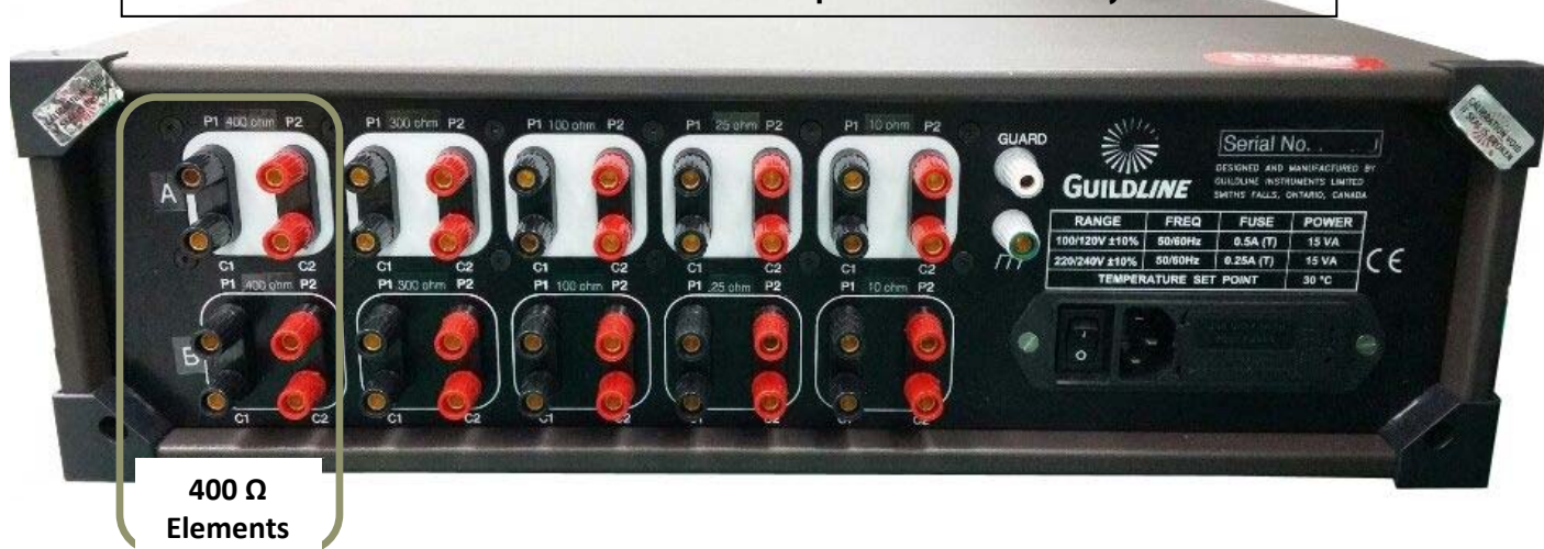
Model 7334TC with 10 Custom Elements in a Temperature Controlled Style Enclosure

Note that these sets shown, when calibrated by an independent National Measurement Institute (NMI) , were reported as "Element Value" White and "Element Value" Black. The results are very impressive as per the following Calibration Report and explanation.