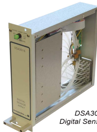
DSA3016/16Px Digital Sensor Array

The DSAENCL4000 uses a micro SD card to store all configuration and module data. The SD card is easily removed if needed for security reasons. The enclosure utilizes a pressure temperature look-up table to compensate the pressure sensors for temperature changes, effectively negating any thermal errors.