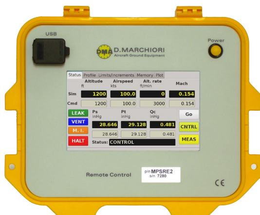
Optional MPSRE2 Multi-coloured backlit 7" LCD touchscreen hand terminal