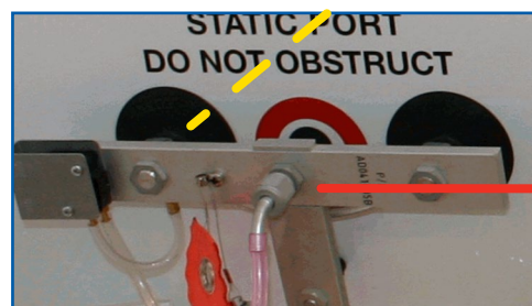
A wide range of pitot-static adaptors and adaptor kits are available from DMA