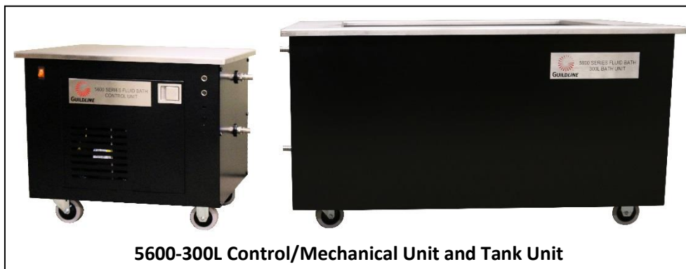
5600-300L Control/Mechanical Unit and Tank Unit

For the larger 300L size there are two separate units, each on wheels. The circulation pump, cooling unit, and electronic hardware are the same, but are placed in a physically separate Control/Mechanical cabinet. This separate cabinet is connected to the separate large 300L bath by insulated flexible hoses that can be of customer chosen length. This unique design allows the 5600-300 Litre bath to fit through a standard door and into a standard elevator and provides flexibility in how the bath is placed in a laboratory. For example the bath tank and the mechanical unit can be placed side-by-side, at right angles, or even with the mechanical unit behind the bath tank.