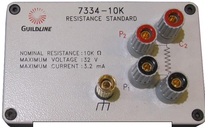
7334 Air Model (Above) and 7334-TC (Temperature Compensated) (Below)

Very High Stability Calibration Laboratory AC/DC Resistance Standards