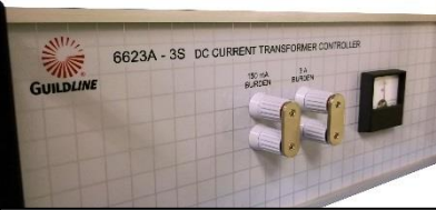
6623A-3S Front and Rear Views

The direct current transformer is designed with an open window to pass through a cable, set of cables, or buss bar that carry the current to be measured. The 6624CT-3000 DC Current Transformer produces an output current that varies directly with the input current in three ranges. By the connection of a reference shunt burden on one of the output terminals the current can also be calculated by measuring the voltage drop across the reference shunt. All necessary interconnections for the control of the 6623A-3S Current Transformer Controller unit and the 6624CT-3000 Current Transformer are provided such that no hardware reconfiguration is required over the full range of operation other than the connection of the output current terminal to an appropriate reference burden.